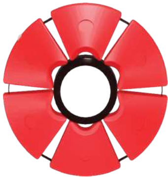
12 inch pipe 6 float units