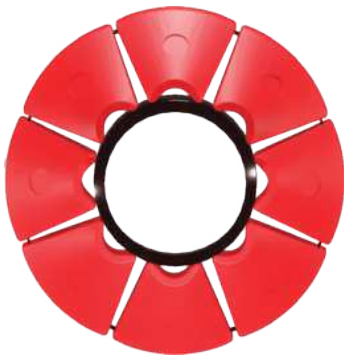
20 inch pipe 8 float units