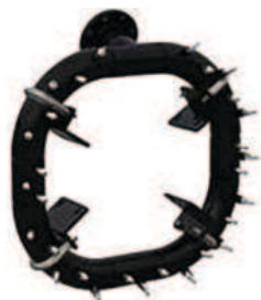
WATER JETTING RING

Enhance your pumping and dredging abilities with our premium add-ons. Our specialized equipment is designed to optimize your project by increasing solids production of your pump. Attachable add-ons are easy to install as the need arises. Contact us today to learn about the best add-ons available for your project.