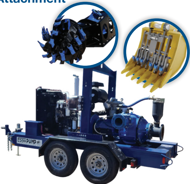
*Typical Deployment Photo. Dredge pumps can be deployed vertically or horizontally. Photos for general guidance. Contact us for further details.